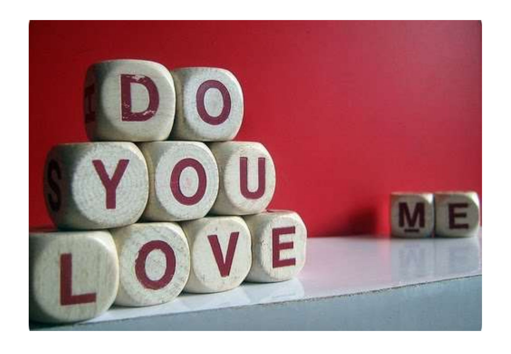
Do you truly love me more than these?"