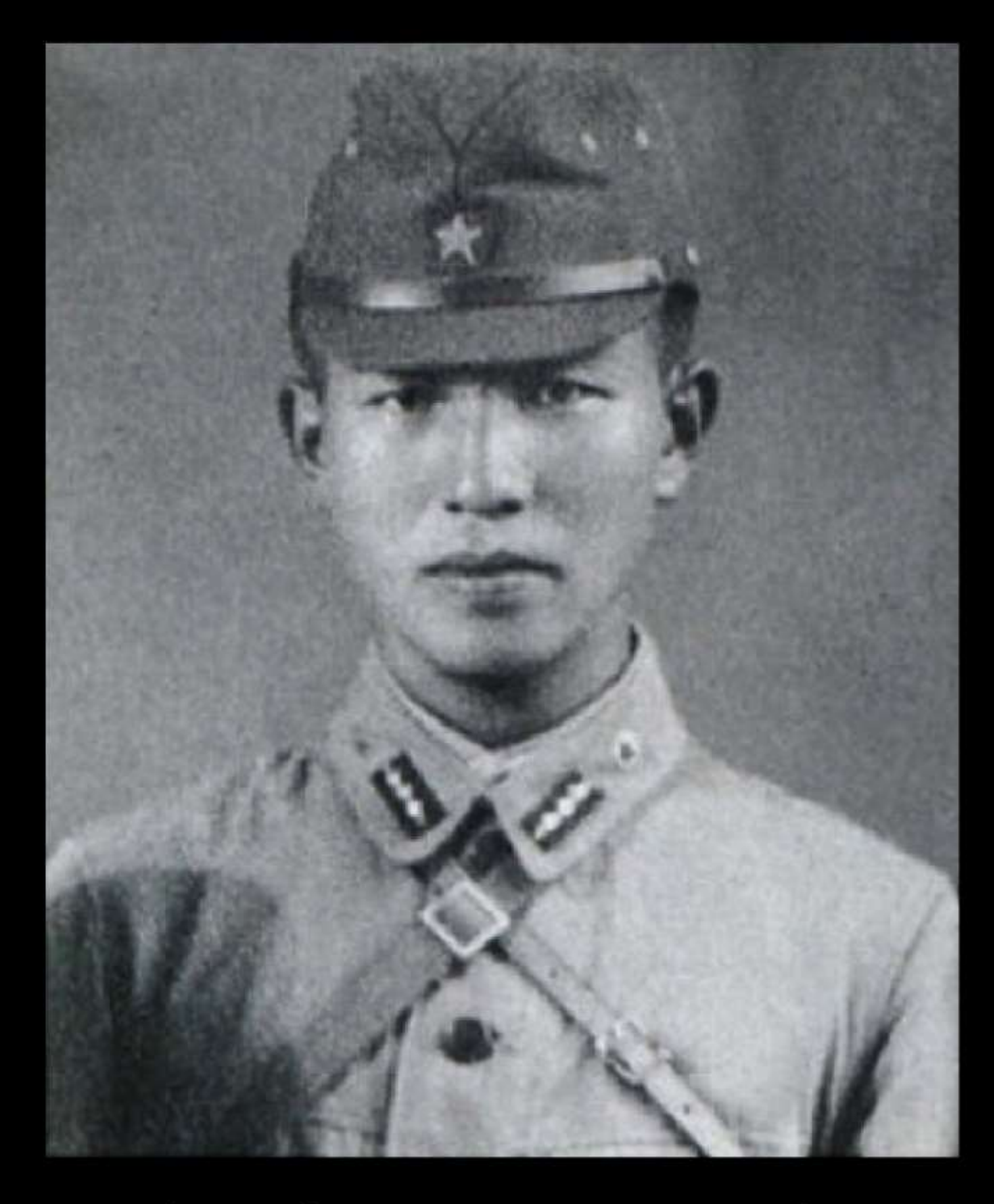
Sub-Lieutenant Hiroo Onoda - 1944