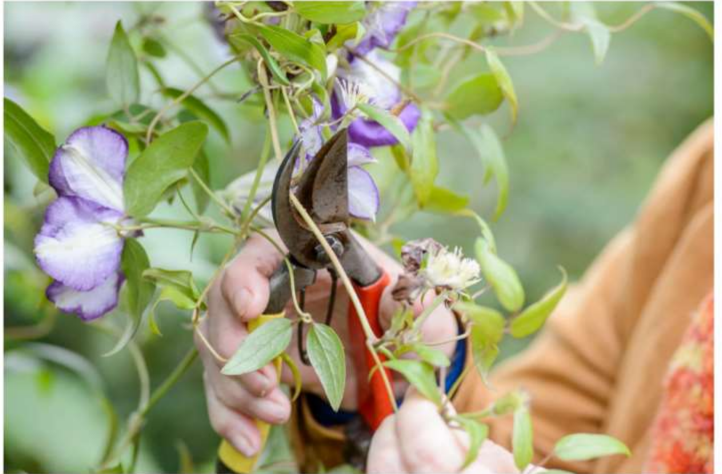
Beginner gardening tips - don't be afraid to prune

Pruning plants can seem like a daunting job, but if you learn how to do the job properly, you'll be rewarded with plants that look good, grow well, and they're likely to flower and fruit better, too. The key to successful pruning is to know when